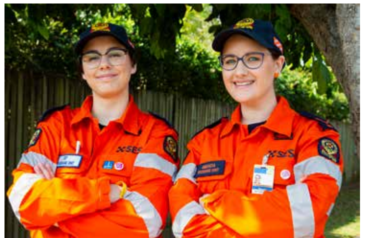
SES volunteers take to the streets to help educate the community.