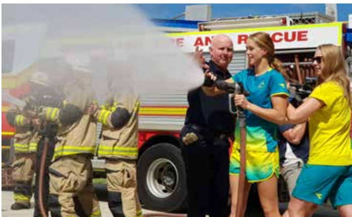
FRS showing athletes the ropes at The Games.