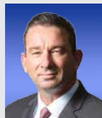
HON CRAIG CRAWFORD Minister MINISTER FOR FIRE AND EMERGENCY SERVICES

Mike Wassing Deputy Commissioner Emergency Management, Volunteerism and Community Resilience Division