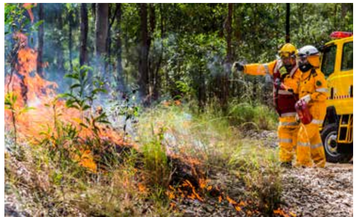
RFS during Operation Cool Burn.